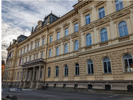
Figure 1: University of Maribor

We cordially welcome you to the 2nd Maribor Workshop on Topological Dynamics, Continuum Theory and related topics! This edition of the workshop is special because we are commemorating the 50th anniversary of the founding of University of Maribor. We wish you an enjoyable and fruitful week ahead! And last but not least: we appeal to all the participants to help us make, with your enthusiasm and willingness to attend, this workshop a continuous annual event also in the years ahead. In particular, if you enjoy the edition of the workshop also this year, please do ask around when next year's event is going to happen - this will motivate us to actually organize it again!